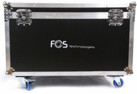
FOS Double Case Wash Q19

Double Case with Wheels for 2 pcs Wash Quad.