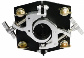
FOS Folded Clamp

Double Case with Wheels for 2 pcs Wash Quad.