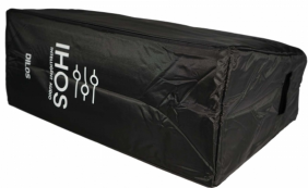
iCover Dilos Cover For Dilos.