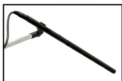
Can be used with shotgun mics (Audix UEM81-S pictured)