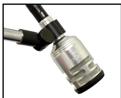
Optimized for use with the Audix D series instrument mics. (D6-Nickel pictured)