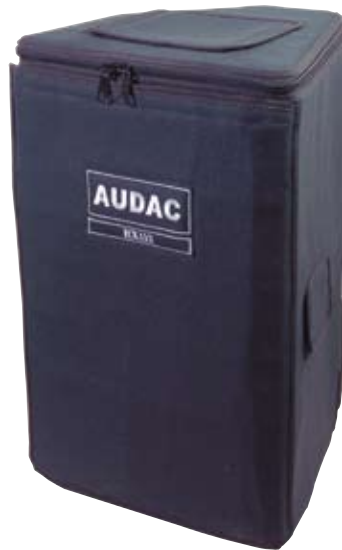
Cover bag for RX cabinet